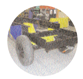
Built on a strong chassis